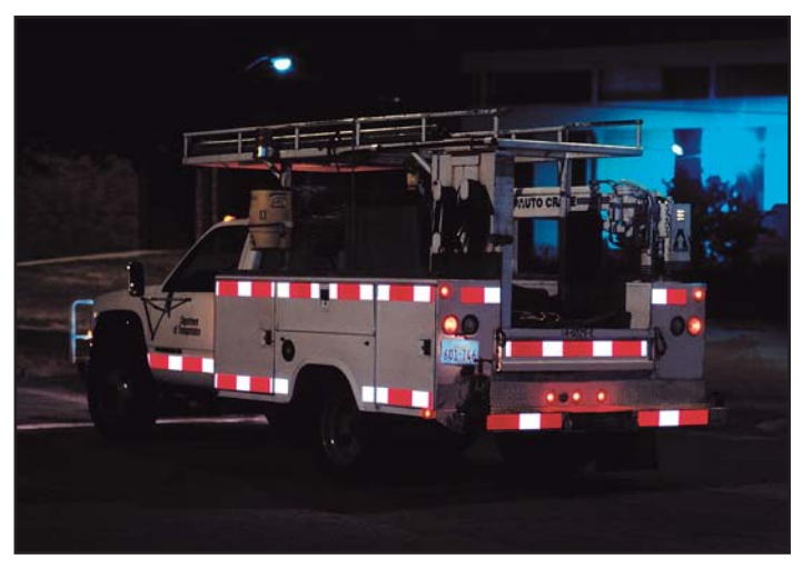
Marked vehicles are clearly visible even when backing up, crossing traffic or making turns.